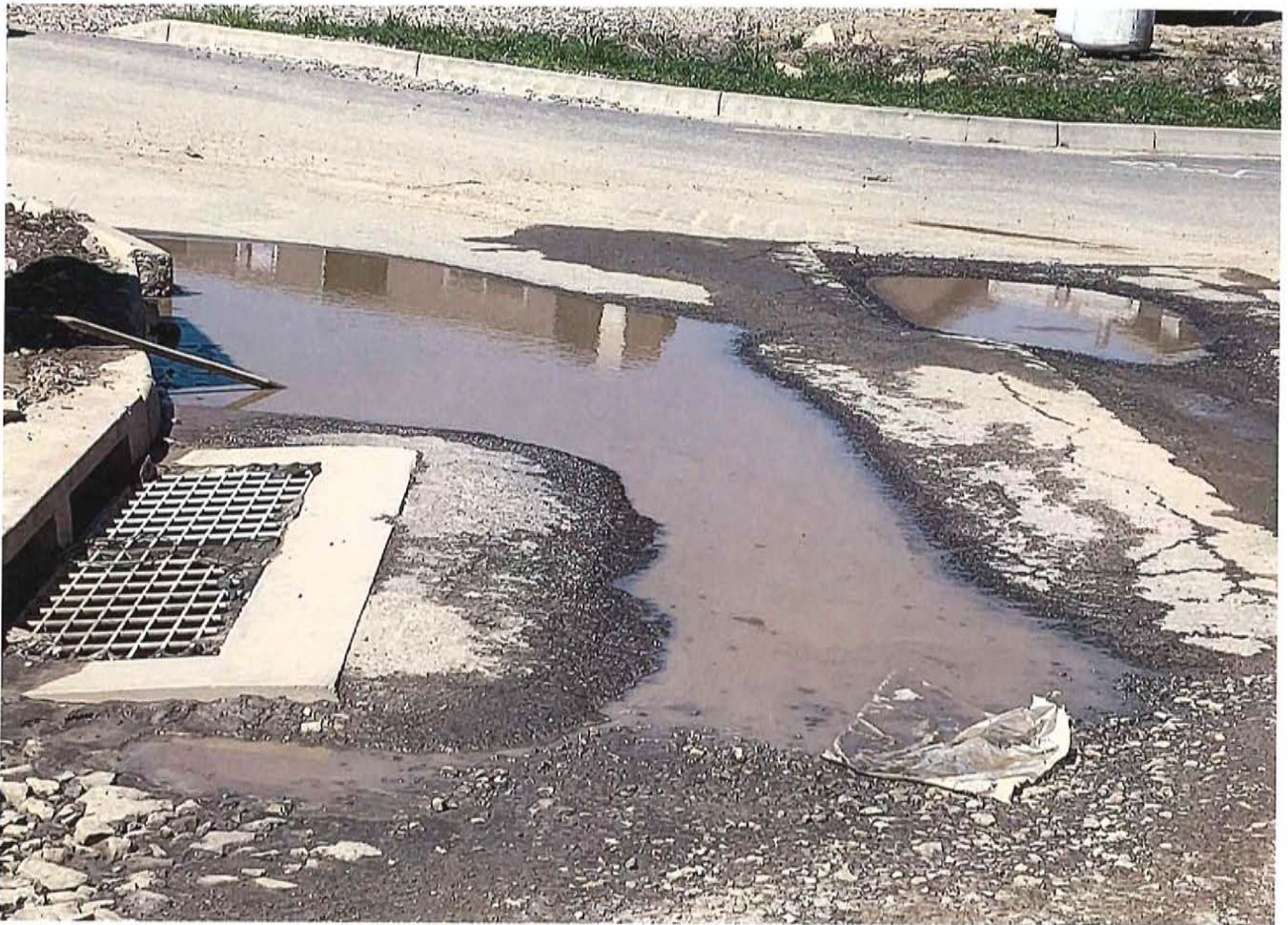
PHASE 4 C - ANTI-TRACKING PAD / Pavement