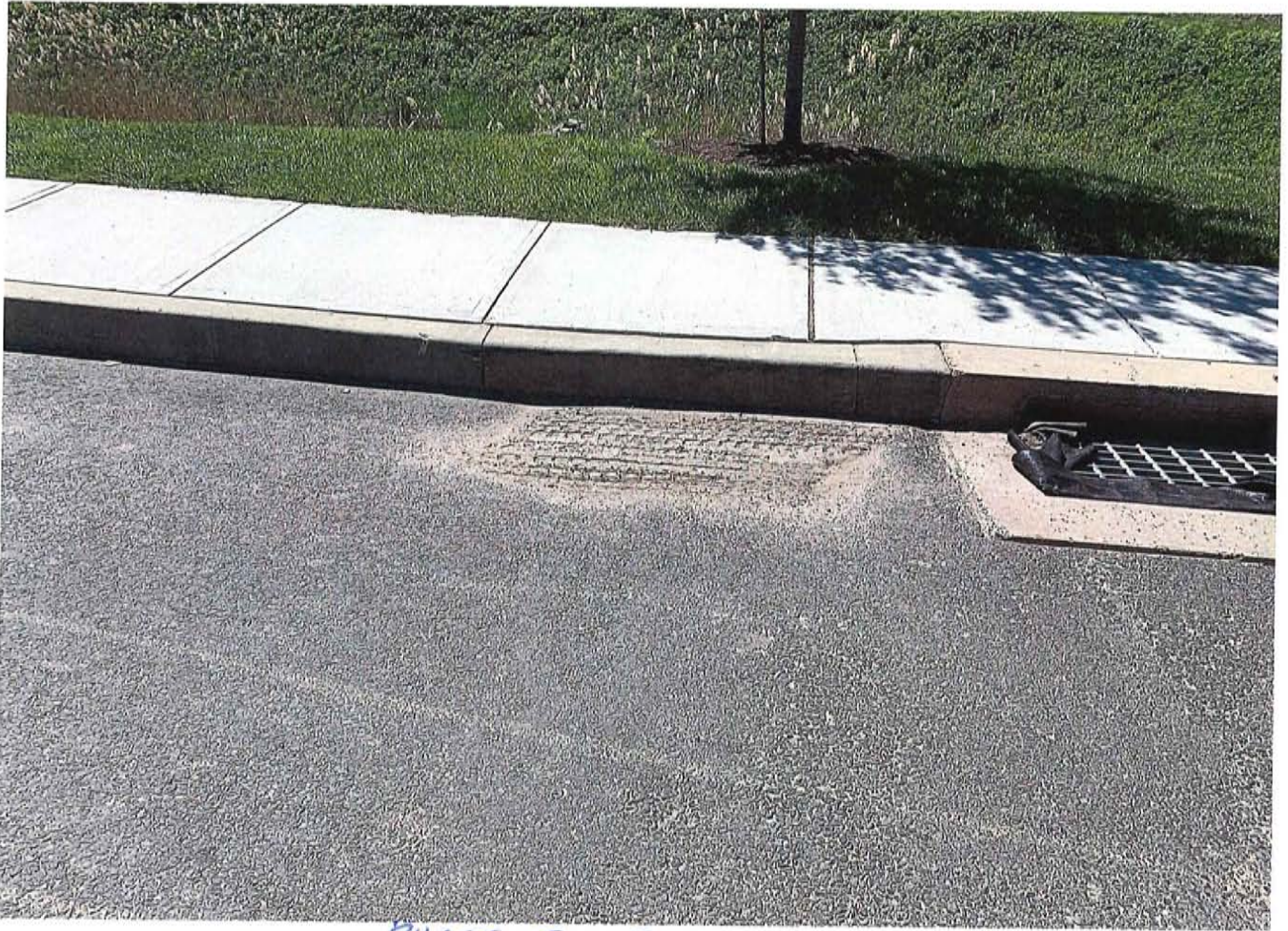
PHASE 5 - SEDIMENT @ CATCH BASINS