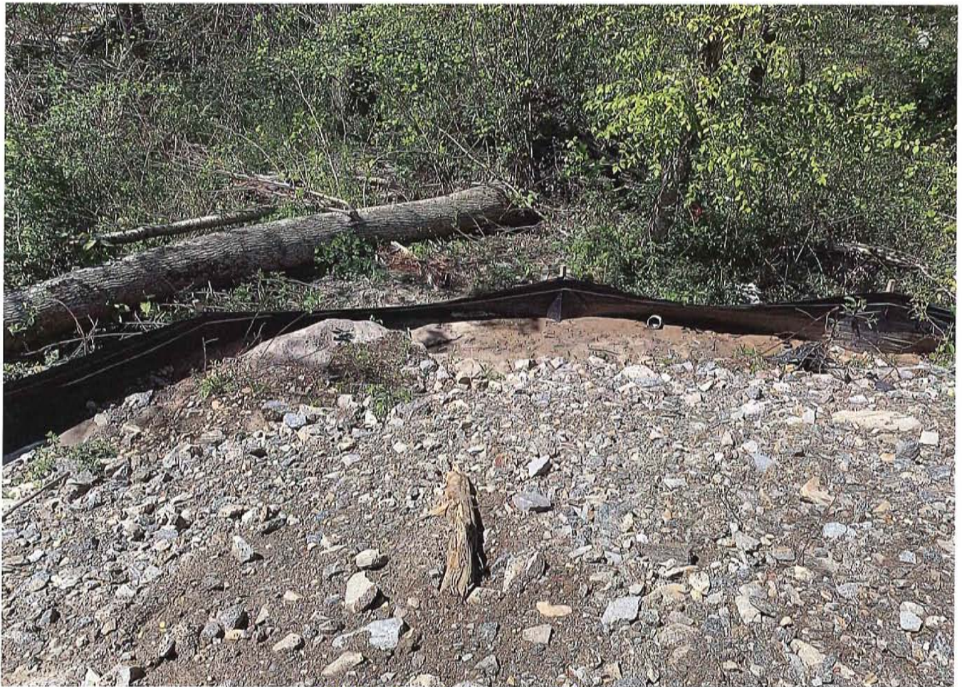
PHASE 4B - SILT FENCES