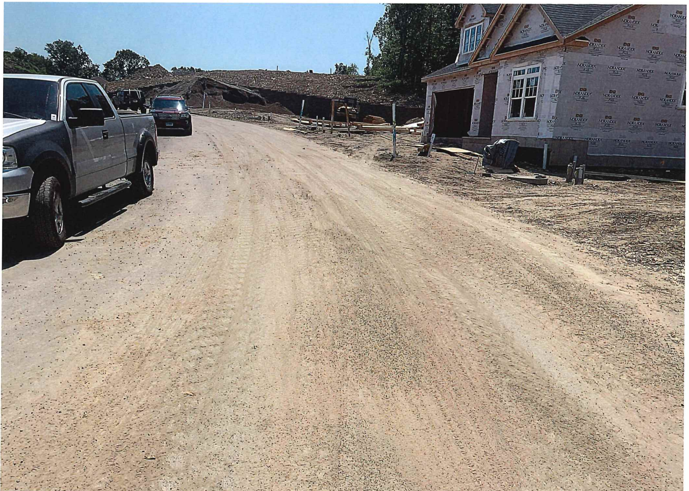
PHASE 4B - DIRT ON PAVED ROADWAY