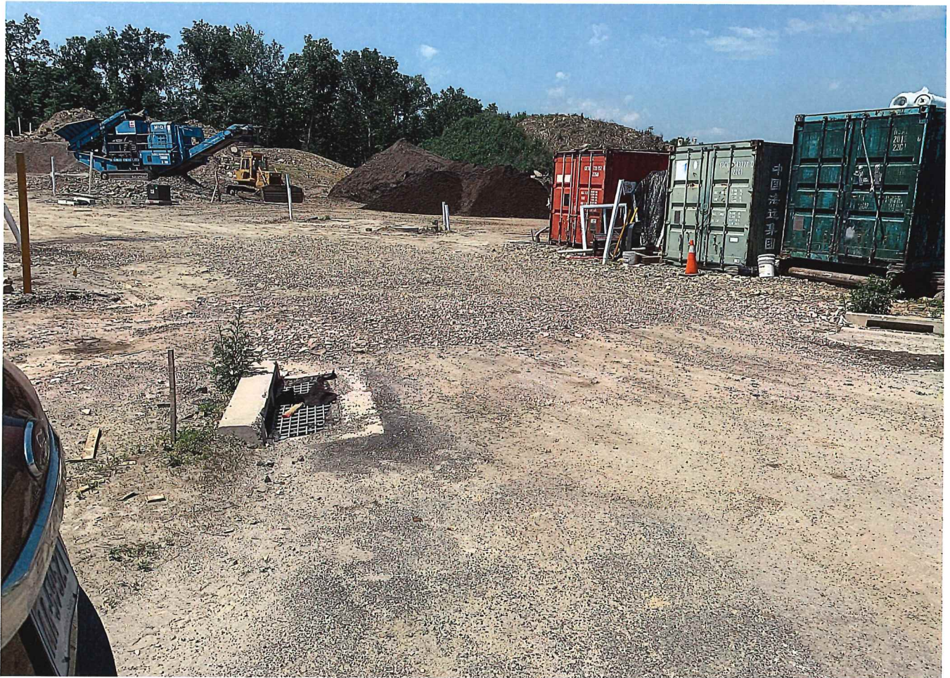
PHASE 4 C - DIRT ON ROADWAY @ CONSTRUCTION ENTRANCE