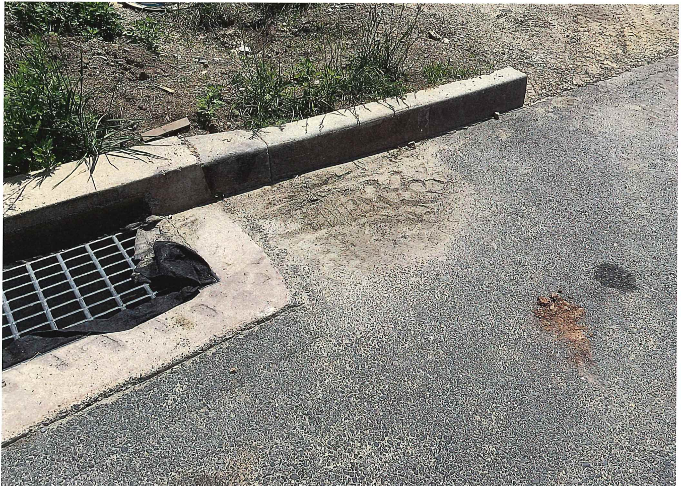
PHASE 5 - SEDIMENTATION BUILD UP @ CATCH BASIN (TYP. OF 3)