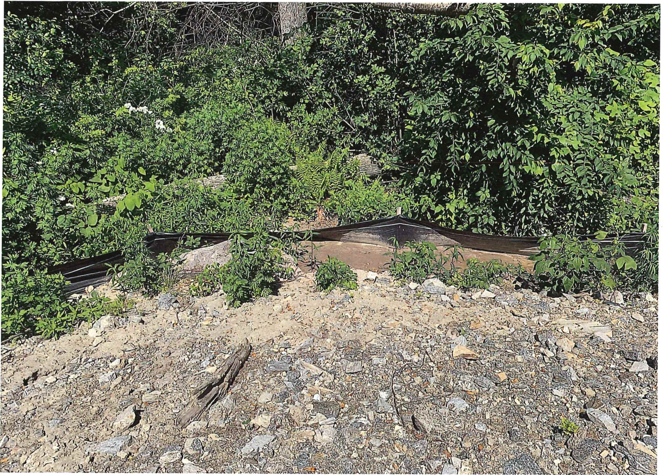
PHASE 4B - SILT @ SILT FENCE