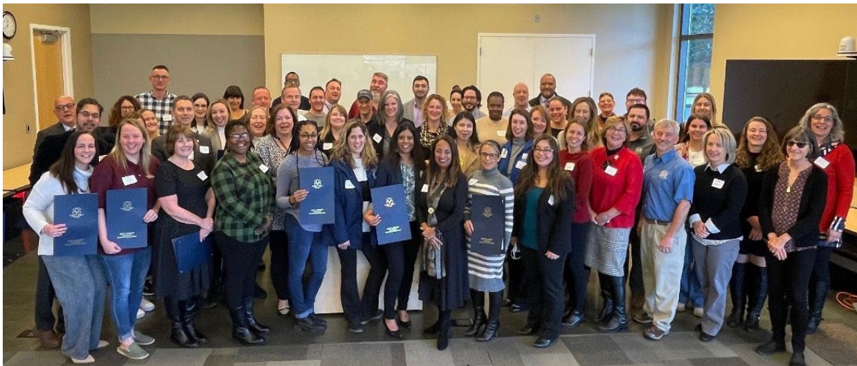
Picture 4: Pictured is a large group of local public health directors and health department/district staff posing with Commissioner Juthani and some CT DPH staff members.