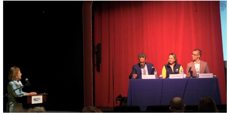
Picture 9 & 10: Pictures from the Valley Community Index Unveiling event on November 15 th at Center Stage in Shelton.